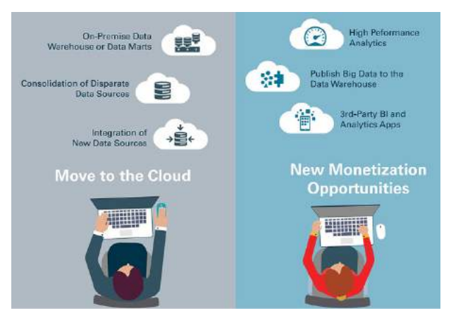
FIGURE 3-2: Common use cases enabled by Oracle ADW.

and database backups. More advanced monetization use cases include high-performance data management projects, data warehouses coupled with cloud computing analytics, and big data cloud implementation (see Figure 3-2).